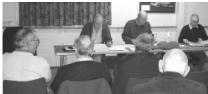
Serious business at the recent AGM