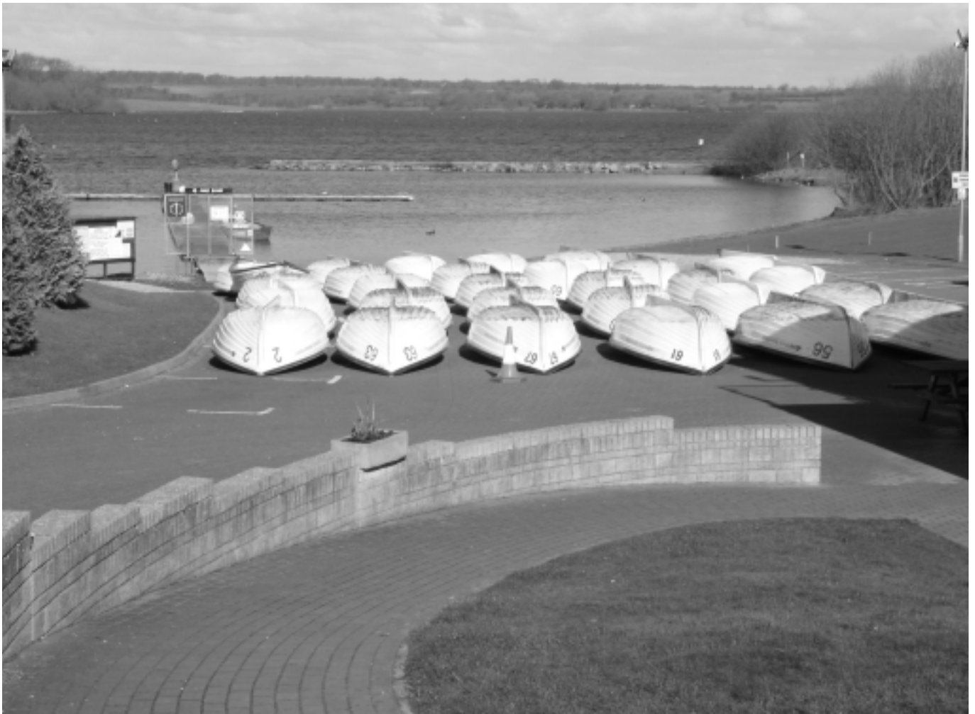
Boats coming ashore to nest at Rutland.