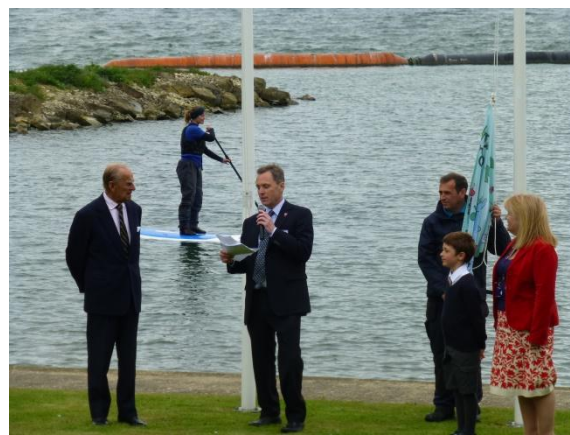
HRH suitably impressed with AW's demonstration of their new fuel efficient boats