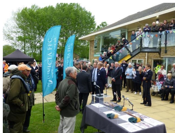
Invicta banners prominent for the official presentation

All in all, it was a very pleasant occasion. The Duke looked well, braving the chilly N wind in only a suit and tie.