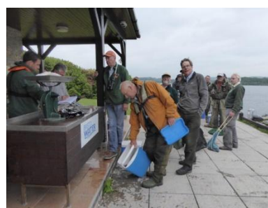
Members of the Invicta team at the weigh-in

On the day Invicta were announced as runners up to Bristol but at the time of publication there was still an issue to be resolved which could change the overall positions.