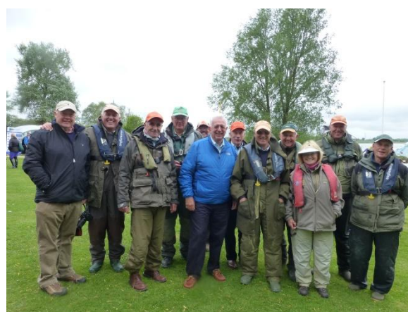
The invicta team present played their part well, many thanks to all.