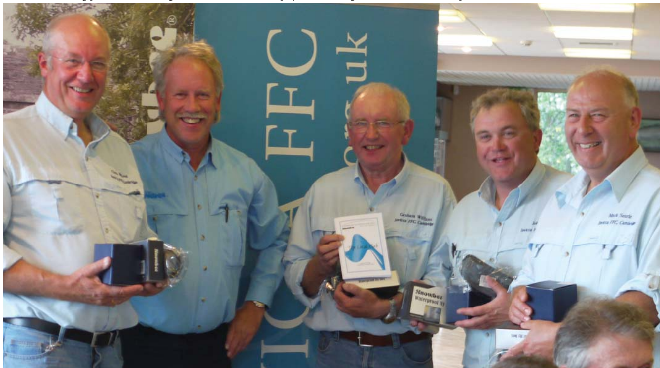
Invicta B receiving prizes for winning the Local Interclub Trophy and coming 4th in the overall competition.